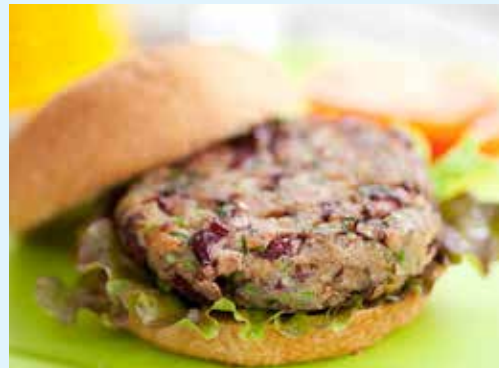
Beanie Burger ►