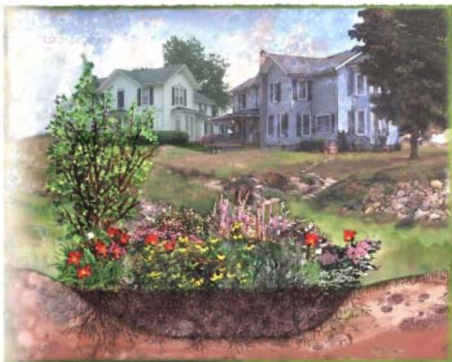
A typical rain garden below the soil (Painting by Ruth Zachary, permission to use by Rain Gardens of Western Michigan)

In 1996, the City of Maplewood partnered with the University of Minnesota Department of Landscape Architecture and the Ramsey Washington Metro Watershed District to implement the Birmingham Pilot rain garden project. Since then, Maplewood has implemented five other projects. Most recently, in the summer of 2003, the Gladstone South project resulted in the planting of over 100 private gardens and four neighborhood gardens.